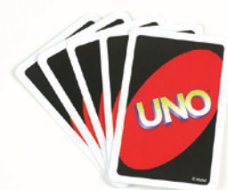
© 2008 Mattel, Inc. All Rights Reserved.

Uno , made in the United States in 1971, is a card game popular all over the world. A national tournament of Uno has been held in Japan since 2006, and over 1,000 elementary and junior high school students took part in the 2008 tournament.