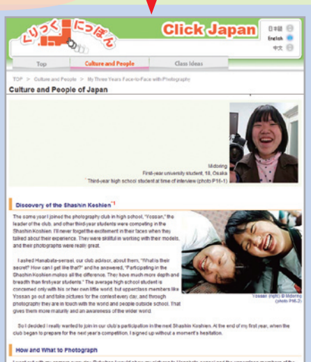
A high school girl's article about photography club experiences.