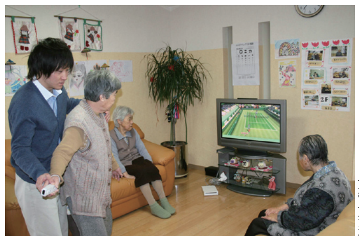
At this facility for the elderly, digital games are being used for rehabilitation.

Source: The Japanese video game market (survey by Media Create)