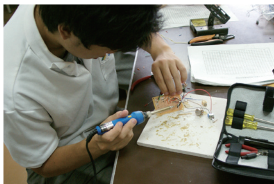
Students solder wires on a home-made circuit board.