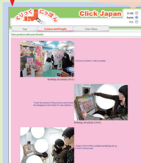
Article on young people enjoying photography.