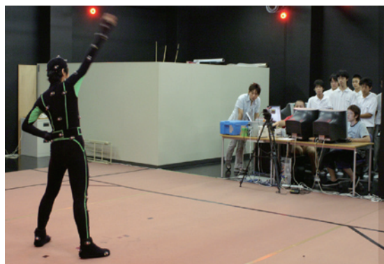
In a special lesson at the university. The process of digitizing human movement through motion capture is demonstrated.