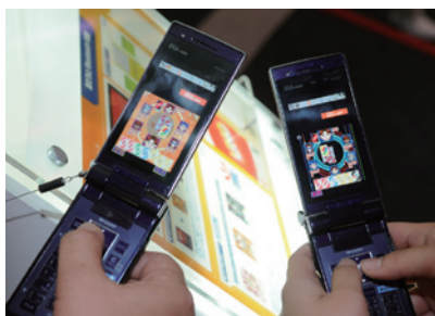
Games can now be played together quite easily even using cell phones.

frustration of defeat, and you can enjoy the process of collaborating with friends to achieve some goal that goes with the game. These days, games that can be enjoyed by people of different generations playing together have been gaining popularity.