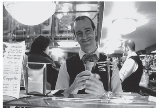
Photo taken during the school study trip to Italy in December of my second year.