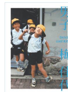
Danshi published by Little More

A photography award founded in 1975 by the Asahi Shimbun Company named after photographer Kimura Ihei (1901-1974) in honor of his contributions to the Japanese photography. The award is given to upcoming photographers for outstanding achievement in photography and exhibition of their works. Most recipients of this award are still in the business as leading photographers of Japan.