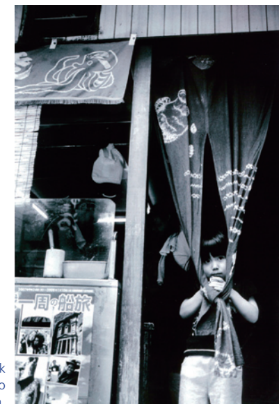
One of the photos I took for our last submission to the Shashin Koshien.