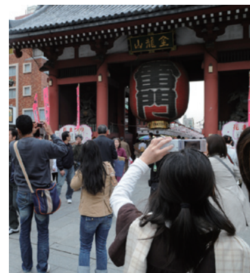
People taking photos with cell phone cameras in front of the Kaminarimon ("Thunder Gate") at Sensoji temple in Tokyo

As more people take pictures on cell phones, photography magazines have begun to publish regular articles on how to take quality pictures with a cell phone, hold contests for photographs taken by cell phone, and publish collections of such photos. Photographs can be sent as an e-mail attachment by cell phone, so sharing photos among friends has become much easier.