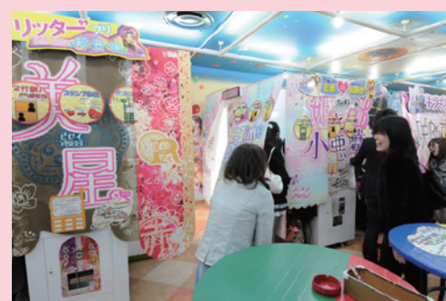
Purikura booths in video arcades.