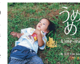
Ume-me published by Little More

Her first collection, entitled Ume-me , sold 110,000 copies (as of March 2008), a rare achievement for a photography collection, for which she received the 32nd Kimura Ihei Award* in 2007. Her other photo