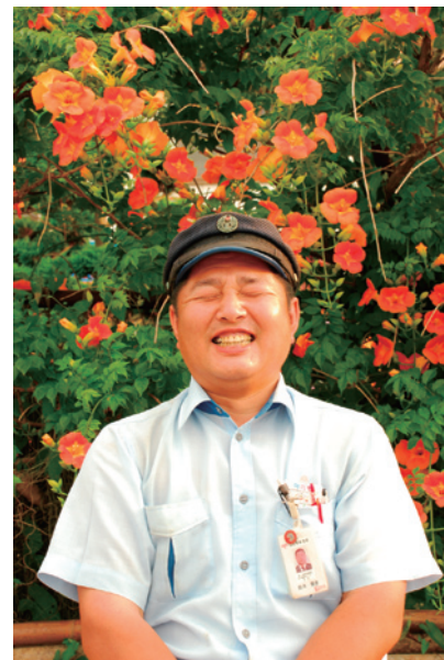
Left: The postman helps the island stay connected to the other islands, and people in touch with other people. He looks just like the main character in the manga, Bonobono . Under the setting sun, he gave us a huge grin.