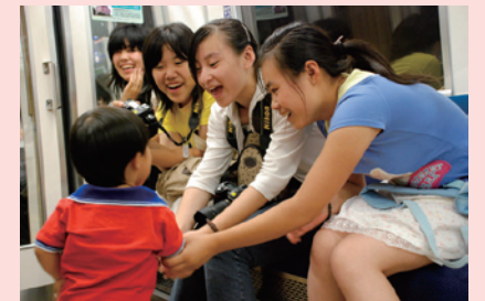
The team encounters a cute little kid on the train.