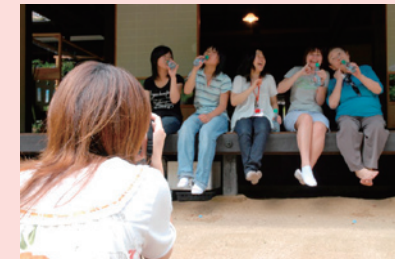
The team takes a break on the veranda with bottles of soda.

Everyone starts to look exhausted, but the photo selection process continues late into the night.