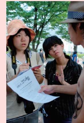
In front of Yoyogi Park, street performers everywhere.

For a detailed record of the photographing and interchange, see the following site: http://www.tjf.or.jp/focusonjapan/en/record/tokyo/index.html