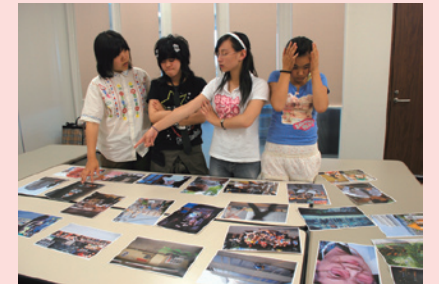
The team spends all the morning of August 9th deciding on the order the photos to be presented.