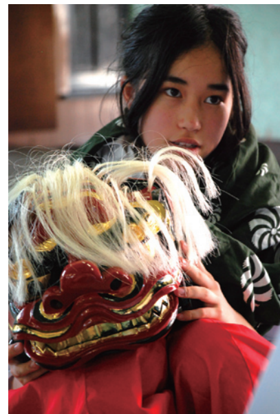
This girl, born and raised in Shiogama, practices kagura (Shinto dance and music). This was the winsome expression she had when taking a break from her arduous practice of hayashi flute and dance.

Through our photo shoot in Miyagi and exchange between our Japanese and Korean team members, we realized the importance of being considerate of each other's feelings.