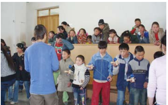
Teaching Mongolian children to play with kendama.