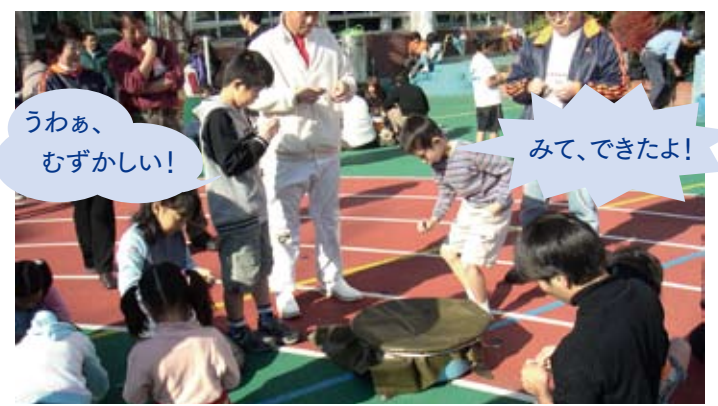
"Oh, this is hard!" "Look, I did it!"