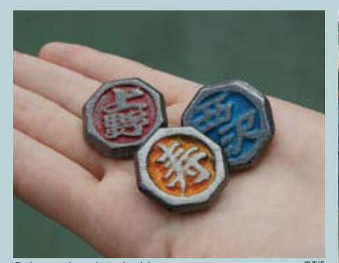
Beigoma imprinted with names of people or places.

Japan Spin a Top Association 🕟 http://www.komav7.com/jsta/jsta.htm Japan Spinning Top Musuem Fig. http://www.wa.commufa.jp/~koma/ Nihon Komamawashi Fukyu Kyokai (Japan Spinning Top Promotion Association) 🖙 http://www.bekkoame.ne.jp/ha/asobi/osasoi.html Nihon Beigoma Kyokai (Japan Beigoma Association) http://www.wa.commufa.jp/~koma/mawashi/index.html