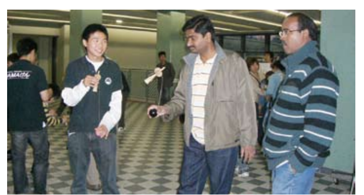
The kendama booth at a Japanese university festival. Foreign students trying their hand for the first time.