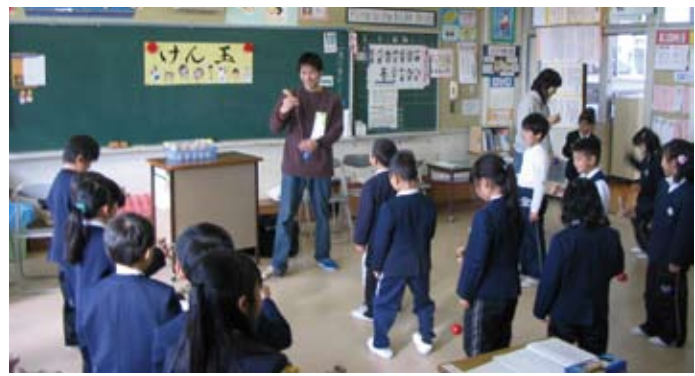
At an elementary school nearby. We are sometimes asked to teach kendama as part of regular classroom study.

The great thing about kendama is that anybody can do it. Age