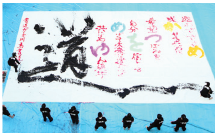
Kawaguchi High School Shodo Club performance work: "Michi" (Path).

*This article was prepared based on an interview held in February 2010. The status of the students mentioned is given as of the time of the interview.