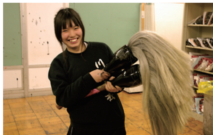
These are large brushes used for performances. When filled with ink, each one weighs about 10 kilograms. Sometimes the performer uses both at once. One work can require three liters of ink.

there was one time when two members got into a disagreement on how we should practice. The anger between the two made the atmosphere very unpleasant. Remembering the teacher’s advice, I suggested to them, “If you don’t explain what makes you angry, no one will understand,” and “if you don’t ask what the other person is thinking, you won’t understand.” After that, they managed to explain themselves to each other and worked out their differences. From experiences like that, I’ve learned that people can understand each other if they can get their ideas across.