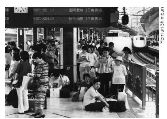
Tokyo Station during the holiday exodus (kisei rasshu), on the Shinkansen platform

Takashi went with his family by Tokaido Shinkansen superexpress train to visit his grandmother in Shizuoka. The terminal at Tokyo Station was clogged with people on their way out of the city ( kisei rasshu ). Every seat on every train was full, so they had to stand. They had bought eki-ben (boxed lunches sold at the station) to eat on the way. After the train stopped and some people got off, a seat opened up, and they all took turns sitting down to eat their lunch. From the windows of the train they could see the ocean on one side and Mt. Fuji on the other.