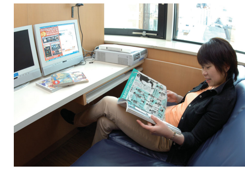
The private rooms are equipped with sofas and massage chairs where customers can relax as they would in the comfort of their own home. Quite a few people can in fact be found napping there.

Step 4. Decide how long you will use the facilities and pay your tab. The rate is 400 yen per hour, and 100 yen for every 15 minutes that you extend your stay. The three-hour set rate at 880 yen and the six-hour set rate at 1,180 yen are a bargain.