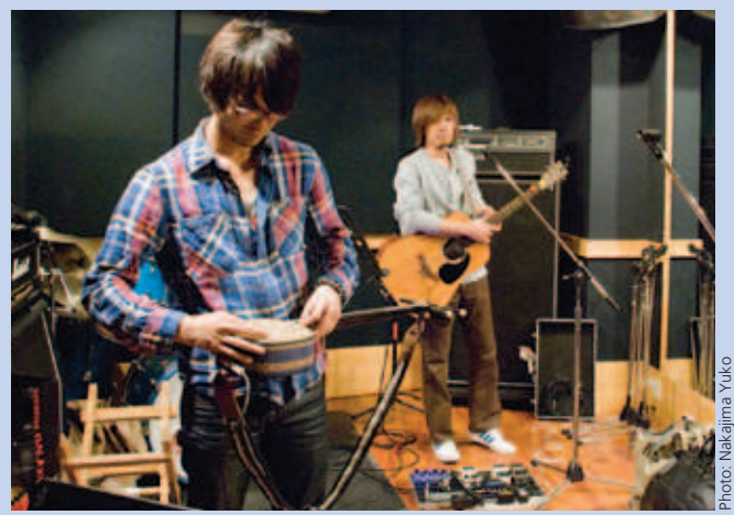
Rehearsing for a concert.

While in university, I devoted most of my time to my studies, rehearsing for classical music performances at university, and playing classical music and Okinawan folk songs ( min'yo ) at public events. I wasn't spending much time writing or performing my own songs back then.