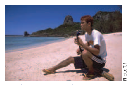
Photo from Deai: The Lives of Seven Japanese High School Students (www.tjf.or.jp/deai).

If I could talk to myself as a high school student, I would tell him, "I'm sure you will encounter hardships in the future, but you become stronger each time you overcome them. Every tough experience is a step toward your dream. No wall is too high for you, and once you climb over that wall, you'll find the world you're looking for." I'd like to send the same message to all the junior high and high school students today. I would be very happy if talking about my own experiences gives a little more courage to people who are working toward their dreams.