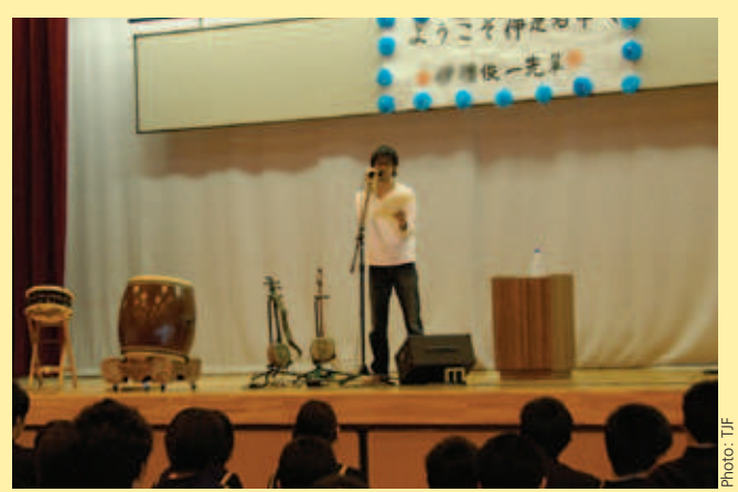
Giving a speech at the junior high school on Izena. I wanted the students on the island to know "you can achieve your dreams."

I would also like to do as much as I can to help the Izena Island community. I've already done a few charity concerts on the island and donated proceeds from them to the local junior high school. I would like to continue to participate in events to help revitalize the island or maybe live in Izena when I'm famous and contribute taxes to the island . . . well, I'm going to have to become popular first, won't I!