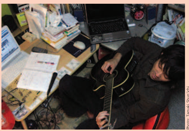
Writing a song at home.

I write songs that carry the message, "A lot of things happen in life, but I'm striving to do the best I can." I feel