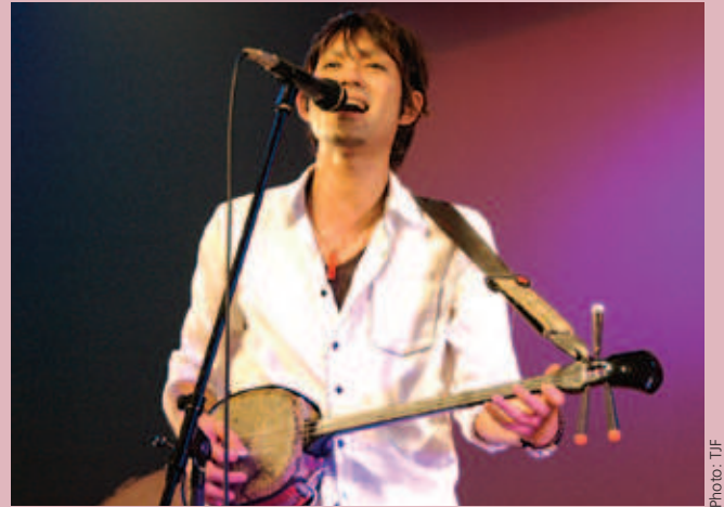
Many of my songs in concert feature the sanshin.

After graduation from university, while supporting myself with a part-time job at a pharmacy and by playing classical music and Okinawan folk songs, I wrote songs and gave live performances. My goal was to release my first CD, so every time I wrote a new song, I visited a music producer living in Okinawa. I would wait in the back quietly until the producer's work was finished, and as soon as there was a moment, I would ask, "Could you listen to my song, please?" At first, I wasn't taken very seriously, and was always told to come back when I had written a new song, but I didn't give up. I continued to work and rework my songs and visit the producer. After about two years of persistence, I finally came up with the song "Kassen soka 夏鮮想歌," a term I made up that means "vivid summer memories." The song is about someone falling in love with a girl at a summer festival on an island. Even though the relationship doesn't last, it becomes an important memory for the character in the song. He feels happy at the thought of her, probably striving towards something, somewhere. The producer really liked this song and agreed to put out my debut single. I will never forget the happiness I felt when that dream came true.