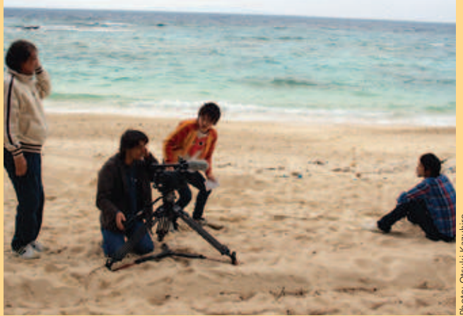
Shooting a promotion video on an Izena Island beach.

I was desperate to regain my voice, but the more I struggled, the worse the symptoms became. I couldn't even sing scales properly. I had no desire to appear on stage, but concerts had been booked far in advance and couldn't cancel them to give my voice a rest. Frequently, I would be close to tears during my performances because I couldn't sing properly in front of thousands of people. Everything had been fun up until then, but I learned then how tough it is to be a professional musician. I began to realize that no matter what I might do, my voice might not return to normal. I might have to quit music. In the end, I didn't quit because I couldn't see myself as anything but a singer-songwriter.