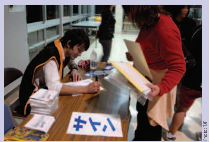
Signing albums after a charity performance on Izena Island. I get specially nervous when giving performances on the island, but everyone is really warm and supportive.

It was a tough year for me, even looking back on it now. But it was an ordeal that taught me the importance of believing in your goal and firmly pursuing it. I became stronger mentally and able to see things from various angles. Without having experienced this hardship, I never would have reflected on my dreams and my professional career so seriously and I probably couldn't have endured the busy schedule that followed. Today, I'm thankful for those tough days that I endured.