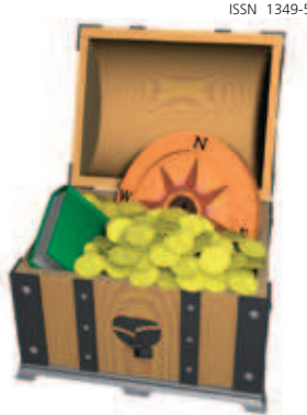
September 2010 No. 25