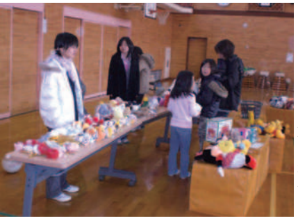
Flea market held at the elementary school to raise funds.

We got together three or four times a week to prepare for this