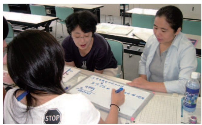
Chinese and Japanese volunteers teach Japanese to a junior high school student from China.

Information on volunteer activities can easily be obtained through volunteer centers and the Internet, making it easier for people today to take part in volunteer activities without joining an organization.