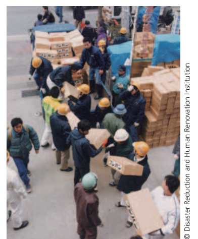
Volunteers moving out relief goods for victims at a disaster site.

The number of volunteers has increased, not only to help out in the case of disasters, but for routine daily activities.