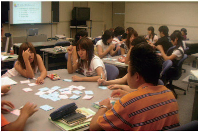
Participants at the Leadership Workshop exchanging ideas.

Specialists were invited to talk about the civil society, nonprofit international activities, the current situation for people