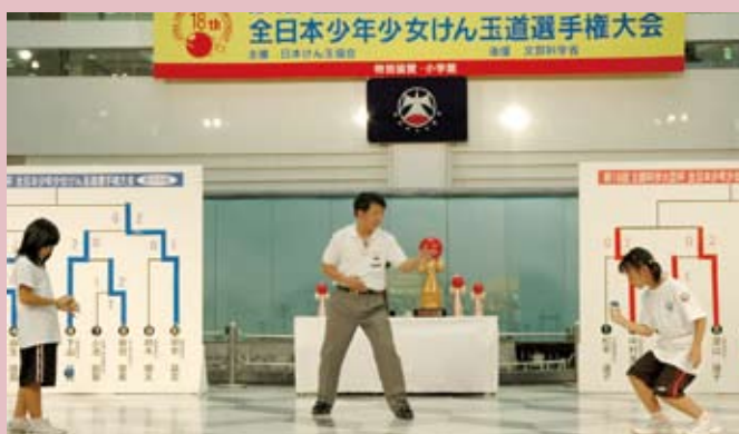
The All-Japan Young People's Kendama Championship Tournament takes place every summer. An elementary school boy and girl who advance through a regional block play in the tournament with their counterparts from other regions. There are ten regional blocks in the country.

Japan Kendama Association http://www.kendamakyokai.com/