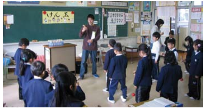
At an elementary school nearby. We are sometimes asked to teach kendama as part of regular classroom study.