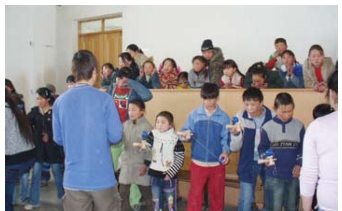
Teaching Mongolian children to play with kendama .