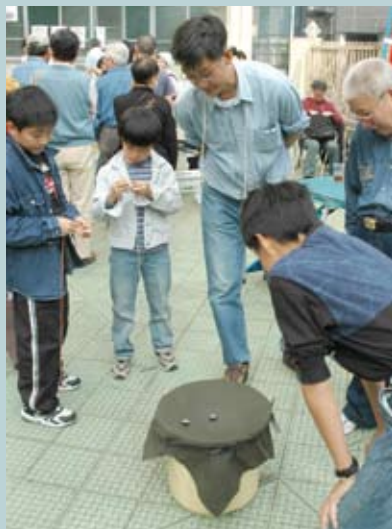
Children and adults of all ages enjoyed beigoma in a festival in the old shitamachi area of Tokyo.