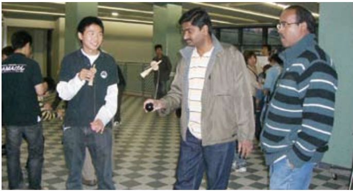
The kendama booth at a Japanese university festival. Foreign students trying their hand for the first time.