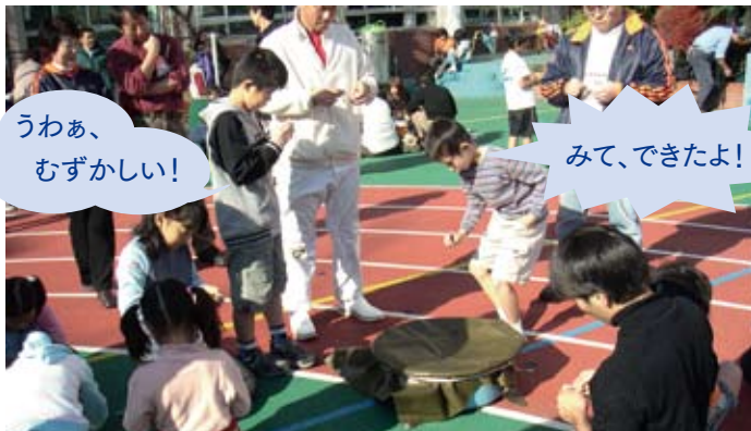
"Oh, this is hard!" "Look, I did it!"