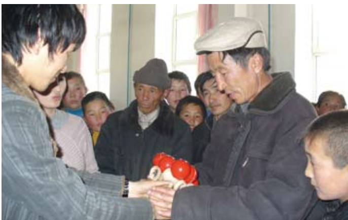
Presenting kendama to friends in Mongolia.

I also find the country of Mongolia very appealing. They have completely different landscapes, cultures, and traditions from Japan. The first time I went there, I was amazed by everything. Once you leave the center of the city, it’s all open natural landscape. In Japan, people are punctual and efficiency is of the utmost priority, but Mongolians are not so tied down by time, which I find liberating. Whenever I return from Mongolia, my friends tell me that I’ve changed. It’s probably the laid-back atmosphere of Mongolia. It costs us about 160,000 to 170,000 yen