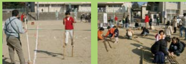
5th National Takeuma Contest sponsored by the Chamber of Commerce of the city of Muko, Kyoto prefecture, in January 2007. A takeuma workshop for parents with their children was also held.

Today, takeuma made from plastic are the norm. Playing with takeuma is said to be useful in fostering balance, and it is a common fixture of play equipment, along with unicycles, at elementary schools and children's recreation centers. There are some elementary schools that invite grandparents, parents, and children to make their own takeuma ; students help one another in making their stilts in class, and hold competitions in which footraces and relay races are all done on stilts.