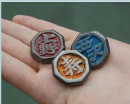
Beigoma imprinted with names of people or places.

Japan Spin a Top Association ☞ http://www.komav7.com/jsta/jsta.htm Japan Spinning Top Musuem ☞ http://www.wa.commufa.jp/~koma/ Nihon Komamawashi Fukyu Kyokai (Japan Spinning Top Promotion Association) ☞ http://www.bekkoame.ne.jp/ha/asobi/osaso.html Nihon Beigoma Kyokai (Japan Beigoma Association) ☞ http://www.wa.commufa.jp/~koma/mawashi/index.html