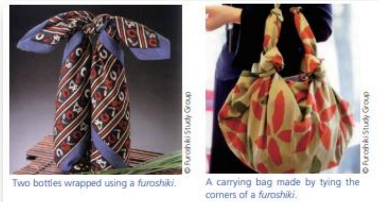
The Japan Forum magazine TAKARABAKO No20

Furoshiki are used in traditional methods of wrapping or bundling in Japan. These square cloths come in different sizes, and can be tied in various ways to carry items of assorted sizes and shapes. Furoshiki can be folded flat when not in use. They are receiving renewed attention because they are both handy and reusable.