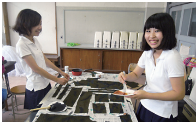
Preparing the outfit. Cutting the fabric and painting a camouflage pattern on it. The pieces are then sewn together and the finishing touches added!

Before I joined the fashion club, I had never made clothes. I learned little by little by asking people around me and reading books. When I first started, I had no idea