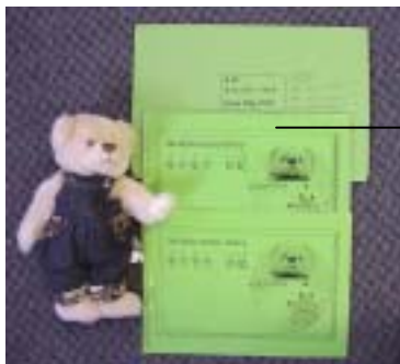
Diary set (students' diary book & phrase + dictionary book) in a folder