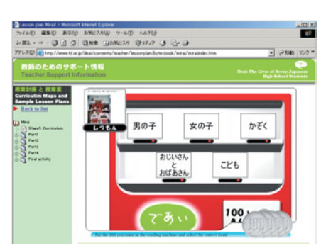
"Jido hanbaiki" game

dents' stories. Links to websites and other resources have already been prepared so that students can carry out their own research.