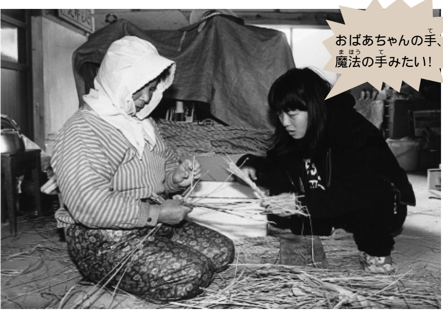
Making shimenawa (ceremonial straw rope)