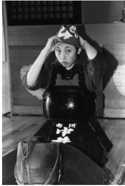
She's in her kendo gear, preparing for a practice match with students from another school. Putting on her helmet, she concentrates on the match.