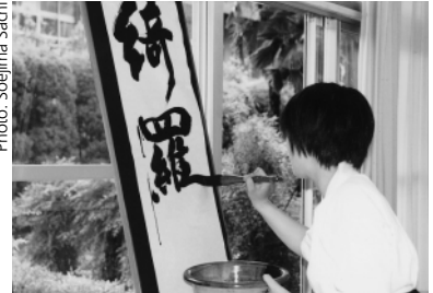
My friend belongs to the calligraphy club. Wearing traditional hakama and kimono , she executed a work of calligraphy before an audience at bunkasai .